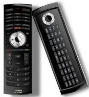
QWERTY keypad on the back of remote